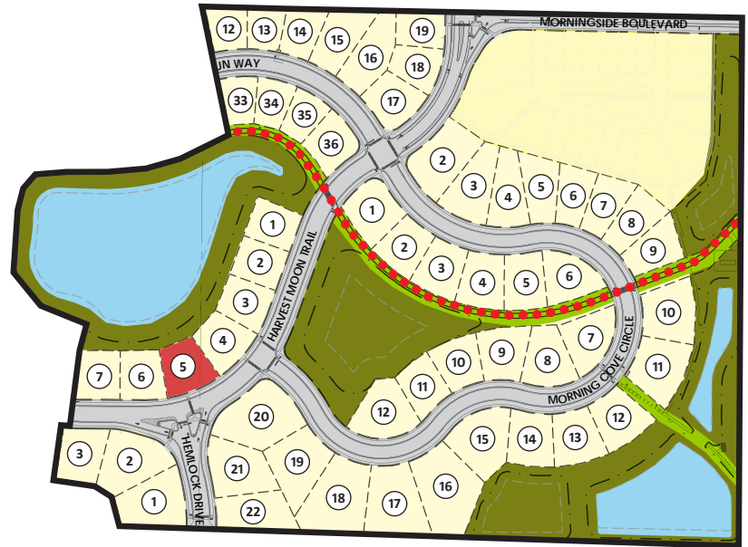
Phase 1 Lots